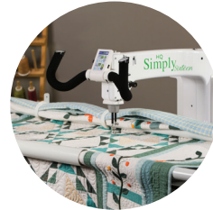
HQ Simply Sixteen®

Choose from the HQ Little Foot Frame or 8-foot Loft Frame